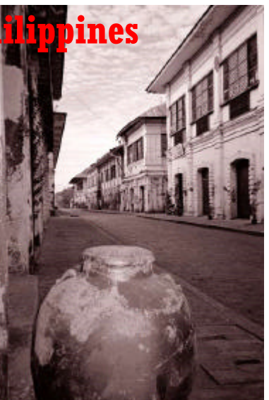
A Vigan, Ilocos Sur streetscape.

Established in the 16th century, Vigan, the capital of Ilocos Sur province, is the best-preserved, exceptionally intact example of a planned Spanish colonial trading town in Asia. it represents a unique fusion of Asian building design and construction with European colonial architecture urban planning and landscape